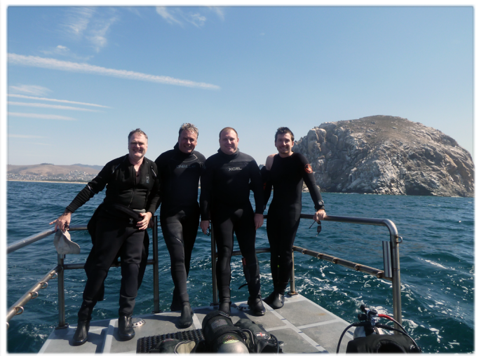
Men In Black (a.k.a. Fantastic 4); Photo by Shawn Stamback

The first site he took us to was one he had only recently discovered and it didn't have a name yet. The site was approximately 2 miles south-