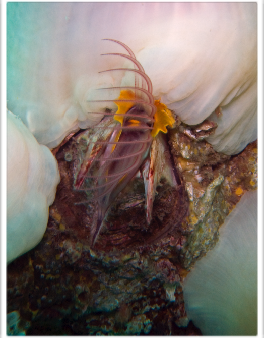
Giant Acorn Barnacle at 10-E Buoy site