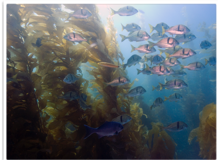
Rubberlip surfperch at Blue Cavern SMCA

One of my goals for this summer was to explore different dive opportunities and destinations in order to add some variety to my diving, and then to share those experiences with the club in case other members are looking to branch out a bit as well. In the end I picked two different dive boats out of San Pedro with day trips to Catalina, and a weekend of camping and diving in Morro Bay, CA. I wrote up a trip report on my first San Pedro boat in the August newsletter. This newsletter has the rest.