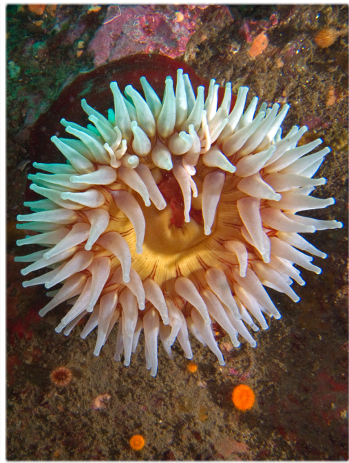
Urticina piscivora at Site With No Name

Sunday morning we dove the North T-Pier in the Morro Bay harbor. There are some rules for diving this site: you have to check in and out with both Harbor Patrol and the Coast Guard, which, fortunately, are located right next to each other and right at the dive site. Furthermore, you are to stay away from the Coast Guard side of the pier and definitely have to stay away from their boats. We were allowed to walk down the "Harbor Patrol — Authorized Personnel Only" ramp and do a controlled seated entry into the water from the dock. Once we were all in the water we went down and disappeared under the pier for what turned out to be a nice, relaxing hour-long dive, even though at times it got a little cramped with four divers in between the pillars of the pier. We dove the pier at slack high tide and there was an interesting change in current that you need to take into account if you're planning to do this dive. It was the obvious result of massive amounts of tidal water entering and leaving the harbor's mouth. There was lots to see: sheep crab, decorator crab, mussels, clams, fringehead and other fishes, nudibranchs, plenty of corynactis and other anemones. The structure of the pillars holding up the pier gave it an extra dimension. This is also a dive I want to do again.