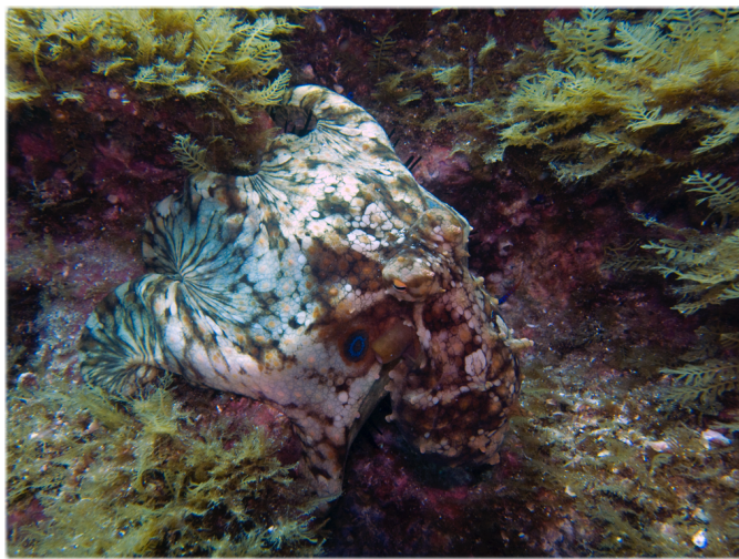
Two-spot Octopus at Bird Rock

After the Midnight Hour we went to Blue Cavern SMCA. Boats are not allowed to anchor in this conservation area so we dove off a live boat. The dive site has some terraced shelves and during the briefing the captain told us to leave the top shelf behind and go deeper in order to find some of the caverns it is famous for. As I went over the edge of the first shelf it quickly got darker and the visibility went down quickly as well, so I decided to hang out on the top shelf and enjoy the few patches of giant kelp that were shimmering in the sunlight filtering through the water. Lots of wildlife in those patches of kelp too. The top shelf also had an interesting rocky structure that made it fun to swim through and explore. I had a beautiful, relaxing dive and, given the stories of the other other divers, I think I made the right decision. This is a good dive site to go back to.