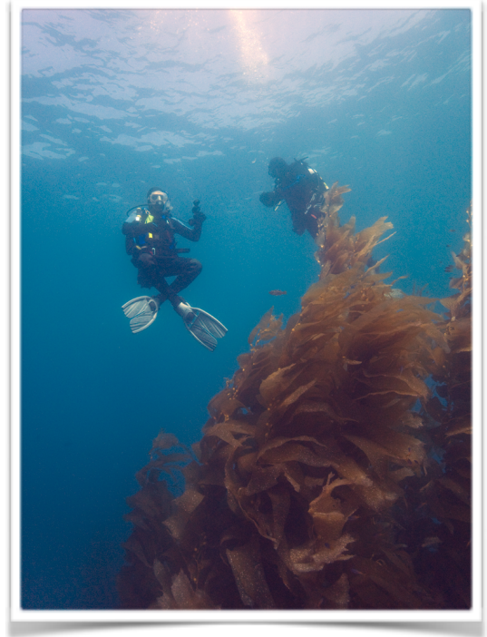
Safety stop at Blue Cavern SMCA

The Asante dive boat was easy to find and board in San Pedro. It's a bit spartan but a very fast boat and it takes only 14 divers (their web site says 12, but there were definitely 14 divers on board). We left around 6:45am and it took about 1 hour and 20 minutes to get to Farnsworth Banks. Unfortunately, when we arrived the dive site was completely taken over by small fishing boats and it was impossible to squeeze us in. Instead we went to dive the wreck of the Midnight Hour off the west end of Catalina. It is a 61' long commercial squid boat that sank in August of 2011. I never cared for looking at rusting boat on the bottom of the ocean and this was no exception. The boat is sitting at 110 feet and we hit a major thermocline at 50 feet. It was really cold down there. Basically I looked at it, swam around it, and went back up the anchor line. There just wasn't that much to see from my perspective.