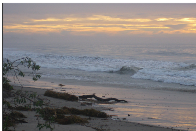
Happy New Year from the Paradise Dive Club!