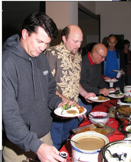
Let's eat! A terrific spread of everyone's holiday favorites.