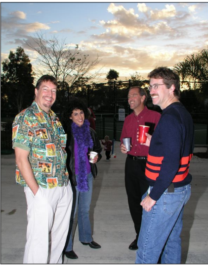
A beautiful afternoon for a party.