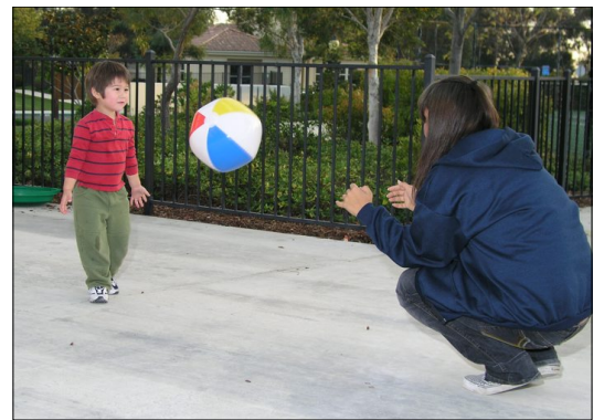
Fun for all ages.