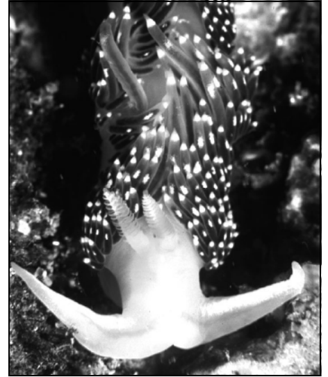
Top: detail of scallop. Bottom: Hilton's aeolid. Photos by Carl Gwinn, taken at Underwater Arch, Anacapa Island.