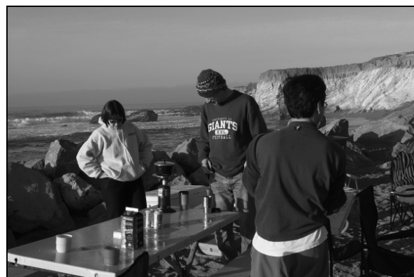
waiting for coffee