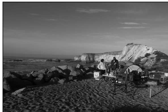
Vandenberg Beach

The ship looked fairly intact as we approached,