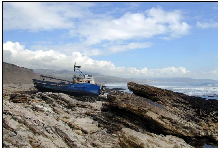
wreck of St. Andrew, at Vandenberg

I know that September is a long way off, but we have another special event that you should mark on your calendars. We were very lucky to be able to reserve the group campsite at Refugio for September 17th & 18th. So jot those dates down and we'll have a nice late summer weekend of camping, diving, and kayaking before the time changes again and another lobster season is upon us.