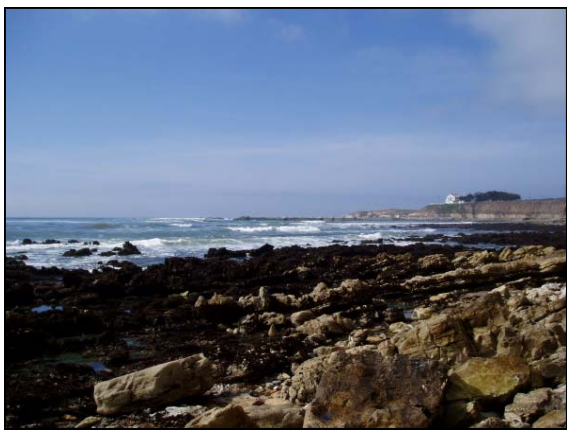
View of Boathouse from arch