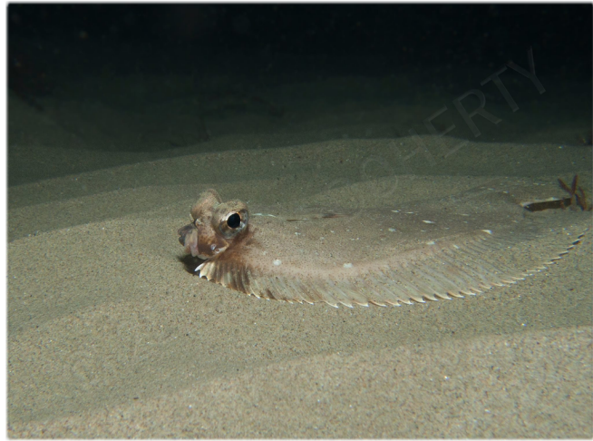
Turbot at Hendry's Beach

dropped to 62°F. We saw lots of (short) lobsters, a shovelnose guitarfish, prawns, lots of swimming crabs, a small turbot, and an octopus sighting was also reported. It was a great dive. Afterwards there was an impromptu Deco Stop at the Boathouse because, well, it was right there and we were cold.