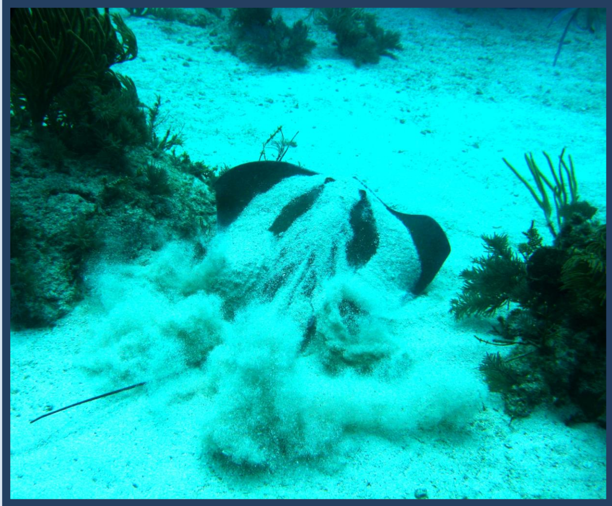
in the Florida Keys. Sting rays showed up on every dive!