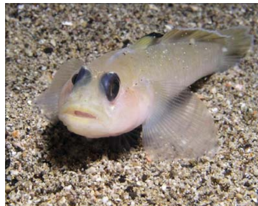
Some samples of Steve's photography: elephant seals mock fighting at Pt. Lobos; black-eyed goby at the Channel Islands.