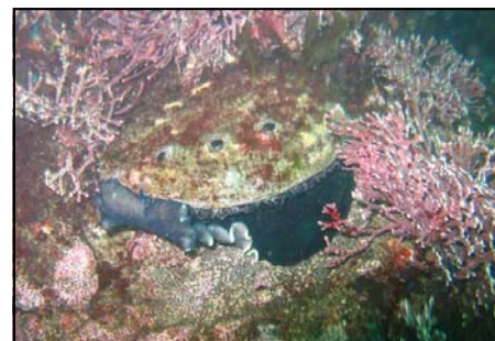
Left to right: Mendocino Headlands, Russian Gulch, red abalone.