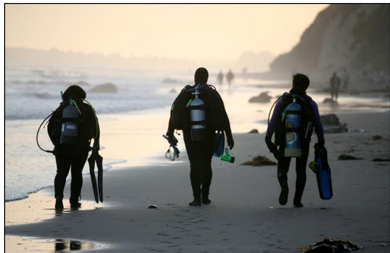
Thursday night divers at Hendry's Beach.

Editor's Note: In addition to the weekly Thursday night dives, mark your calendars for our upcoming weekend day dives: July 15, noon, at Butterfly Beach; August 13 and 26, also at noon, locations to be determined.