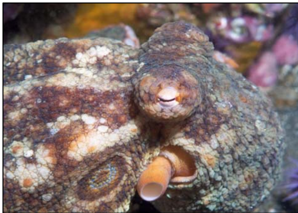
Octopus showing his false eye

There is also something about diving that makes the air seem clearer, the sun brighter, and the appetite heartier. Although the Peace and the Truth boats have good food,