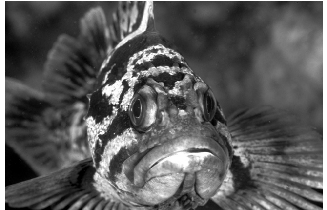
Black-and-yellow rockfish at Santa Cruz.

Come on out to our meetings. Meet fellow divers and find out more about our local dive opportunities!