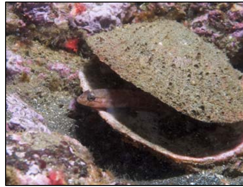
Blackeye goby in his cast-off scallop shell home

At the second site, the visibility was not as good as the first, so I decided to go scallop collecting. Being a novice hunter, I tried to pry them off the rocks with my dive knife. Much to my surprise, I found that scallop glue is stronger than stainless steel, as my knife broke in