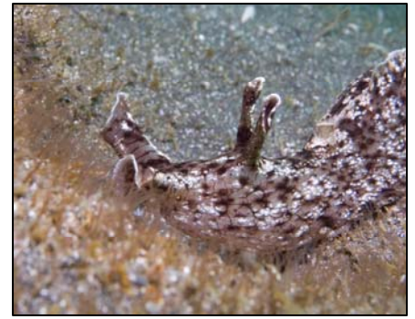
Sea hare feeding on algae—note his tiny eye

Both dive sites were on the backside of Anacapa Island, which is only 11 miles from the Channel Islands harbor. The first site had cold, clear water and a host of photogenic critters awaiting my camera. It is rare that I get so many good photos from a single site. I am usually content if I get one or two.