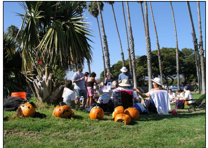
Pumpkins & picnickers at Goleta Beach U/W Pumpkin Carving Contest

Bring your checkbooks (or cash!) to this meeting to pay for the holiday party and...T-shirts and sweatshirts! They will be available at this month's meeting. New colors and sizes will be available for the first time in a couple of years.