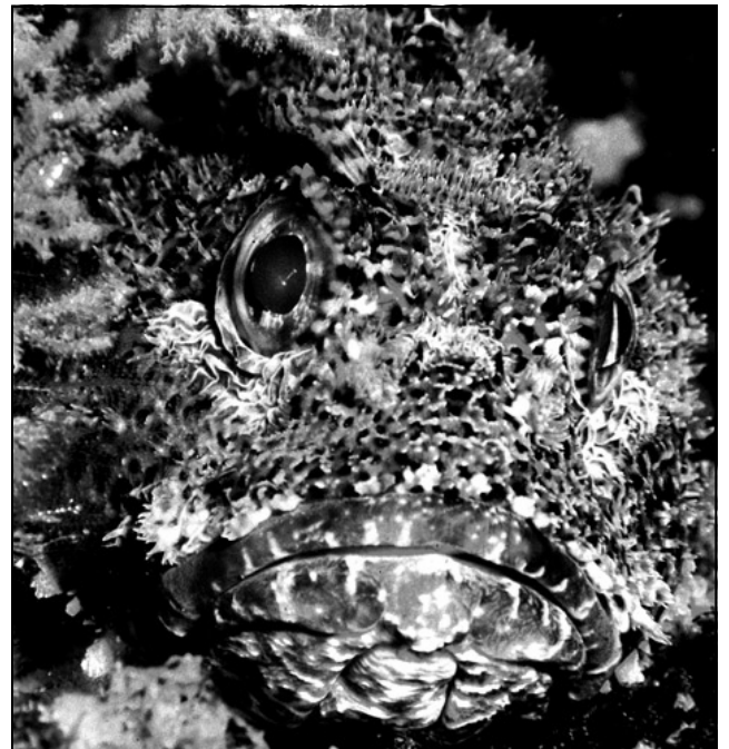
California scorpionfish, Cathedral Cove