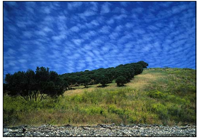
View from Smuggler's

“Giant schools of blacksmith in the kelp. Patty’s beer.” –Beth Gwinn