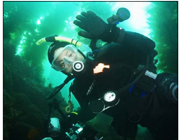
Clockwise from top left: moray eel—photo by Will Chen. Will Chen in action—photo by Steve Trainoff. Juvenile garibaldi—photo by Will Chen. Kelp in sunlight—photo by Steve Trainoff