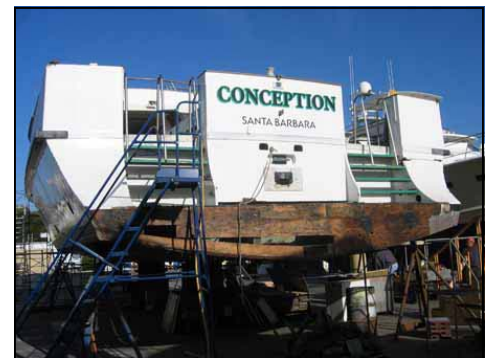
Conception in dry dock

"My very first trip on a boat was on the Conception out to camp at Santa Cruz Island when I was 4 months old—I even got a bonus ride in the Avon ! I had a great time camping, and we also had a memorable trip back when, in high seas, we hit one wave hard enough to break a section of rail off the boat! I hope to be back to enjoy the Conception many more times!" —Jonathan Weakliem