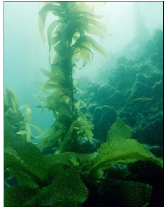
Sunlight through Catalina kelp forest.

A block of hotel rooms have been reserved for Paradise Dive Club members. For reservations, contact Patty Bryant at 684-6342 or Ed Stetson at 687-4771. Spaces are limited, so register early.