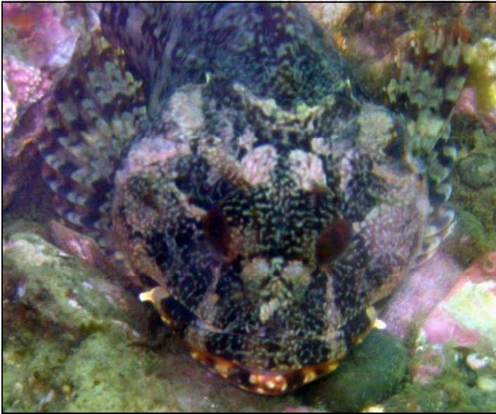
Up close & personal with a California cabezon