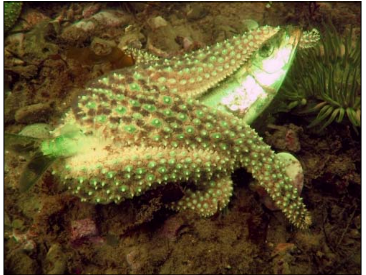
Carnivorous starfish enjoying a mackerel