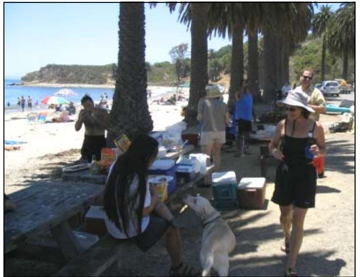
Another beautiful day at the beach