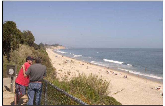
Summerland Beach

The dive was better than expected: pairs didn't even get separated if they stayed within three feet of each other and wore really bright neon fins (and if you don't have a pair, Dan has a leftover rummage sale set of yellows for $30). Reports of rays, sheep crabs, and a few bugs were heard after everyone dried off. Now to help out my fellow PDC'ers, the bugs were towards the far left of the beach when you are facing the water. Good luck come the season!