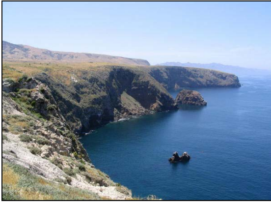
Potato Harbor

Friday morning we woke to sunshine! News had been calling for low clouds and fog for the whole trip. Great weekend for allergies for Denise and Veronica. —Denise